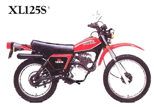
Big bike features on a smaller, economical dual-purpose bike with a 124 cc four-stroke engine and six-speed transmission.