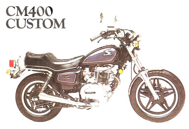
395 cc counter-balanced twin. This new custom features a 3.7 gallon fuel tank and highlighted ComStar ^{TM} wheels.