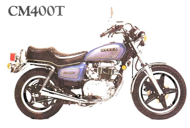
Custom styled, 395 cc twin. Air-adjustable forks. Power Chamber<sup>TM</sup> exhaust system. Engine counter-balancers.