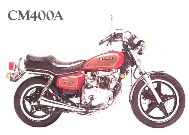
A reliable, mid-sized bike with Honda's exclusive semi-automatic transmission.