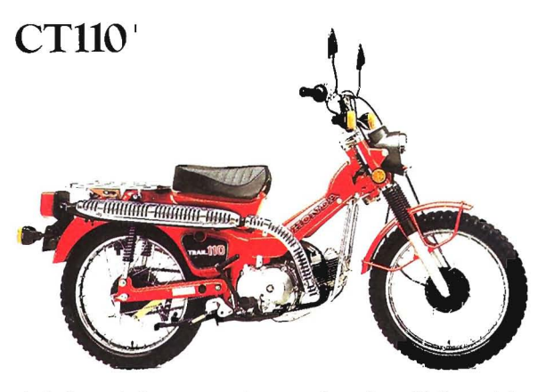
A lightweight, rugged street legal trailbike with dual range gearbox, step through frame and automatic clutch.