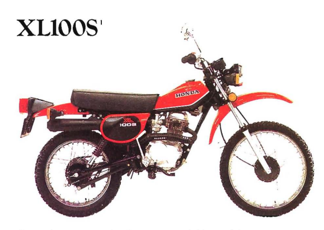
A scaled down dual-purpose bike with an economical 99 cc OHC engine and five-speed transmission.