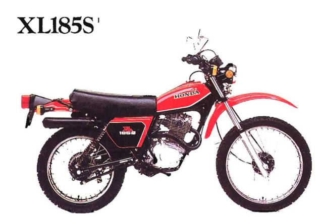
A sturdy, light, economical dual-purpose motorcycle powered by a rugged 180 cc engine that delivers great gas mileage.