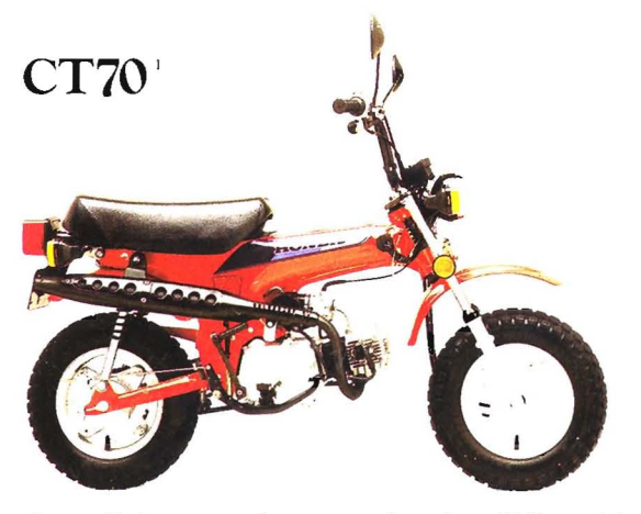
A small, inexpensive street legal trailbike with a 72 cc OHC four-stroke and automatic clutch.