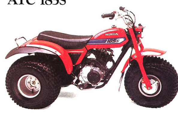
A mid-sized three-wheeler powered by a mighty 180 cc four-stroke engine mounted in a small light frame.