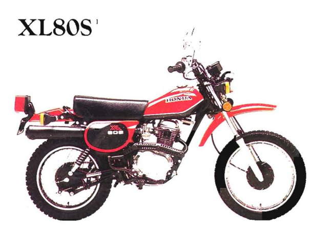
Its small size and predictable powerband make this dual-purpose bike ideal for young beginners.