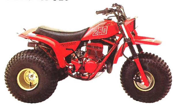
Three-wheeled sports spectacular. Full suspension and a 248 cc reed-valve two-stroke engine.